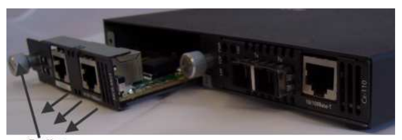
Captive retainer screw