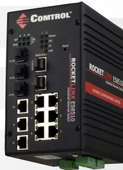
Part Number 32062-3