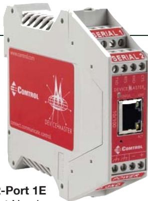
2-Port 1E Part Number 99480-0