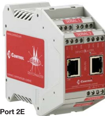
2-Port 2E Part Number 99481-7

Control's DeviceMaster RTS line offers enhanced performance, features and reliability with the introduction of the DeviceMaster RTS 2-Port 1E and 2E models.